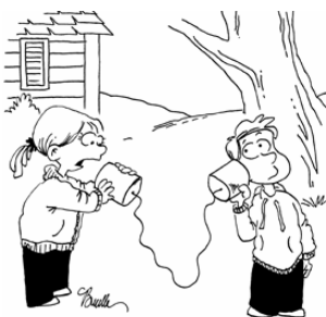
"How do you send text messages?"